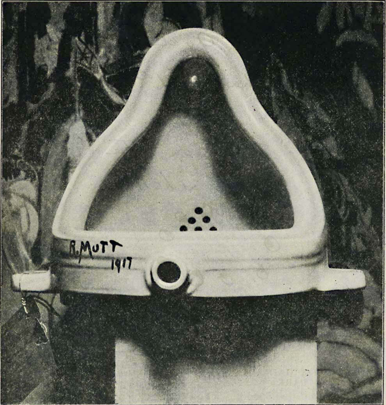
THE EXHIBIT REFUSED BY THE INDEPENDENTS